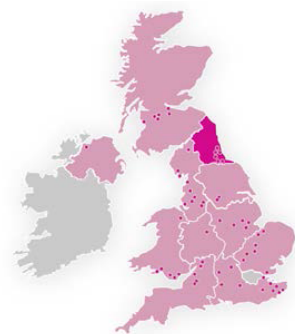
Netomnia Deployments as of January 2023